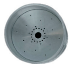
High Flow Gun

Width: 27.56 in (700 mm) Length: 25.59 in (750 mm) Height: 21.34 in (1050 mm)