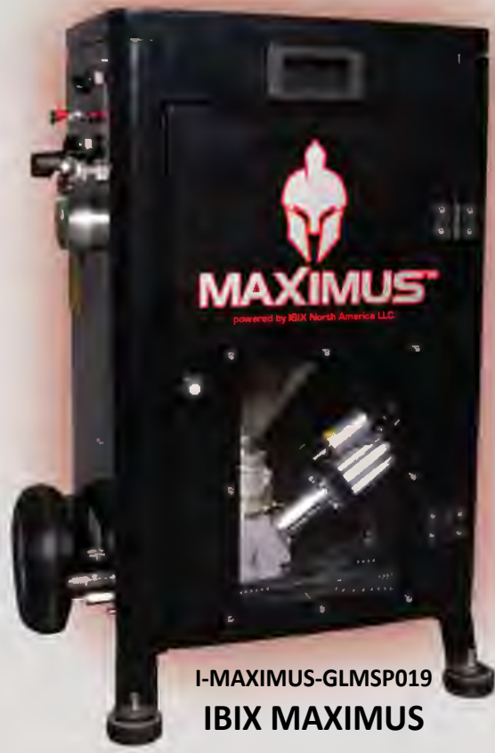
I-MAXIMUS-GLMSP019 IBIX MAXIMUS

High Volume Flame Coating System for TOUGH COAT polymer finish, ideal for on-site coating for concrete, steel and pipelines, 800 - 1,000 sqft/hr. TWO GUN operation for maximum efficiency