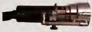
IBIX MAXI High Volume Concrete Application Gun with Cooling System -INCLUDED- I-MaxiConGun-BL-C