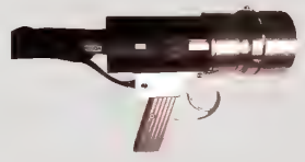
IBIX MAXI High Volume Steel Application Gun black, with trigger -INCLUDED- I-MaxiSteelGun-BL-S

High Volume Flame Coating System for TOUGH COAT polymer finish, ideal for on-site coating for concrete, steel and pipelines, 800 - 1,000 sqft/hr. TWO GUN operation for maximum efficiency