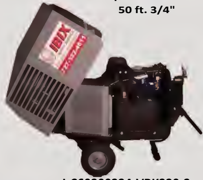
I-C60200224-VRK220-2 IBIX Rotary Screw Compressor with Water Separator