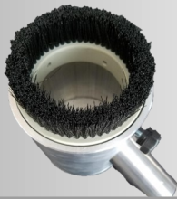
Vacuum Shroud Attachment

For low dust blasting Suitable for: IBIX Pro 3, 9 and 25