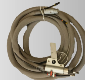
IBIX Pro 3 Gun with Hose 0.8" x 20'

With 3 mm (1/8") Tungsten Nozzle and Waternozzle With female Quick Connect for easy connection to system With Rilsan Hose for air and water supply Complete with protection sheath