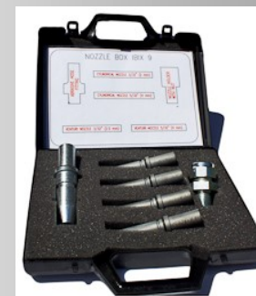
IBIX Pro 3/9 Nozzle Kit