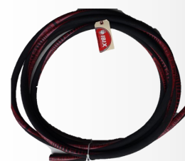
IBIX Pro 3 Abrasive Hose

with Quick Connect female part with Quick Connect male part