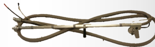
IBIX Pro 3 Lance with Hose 0.8" x 20'

Vortex, with Tungsten Carbide Tip 3/4" (0.8") x 20' Hose with Quick Connect