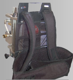
Back Pack Unit