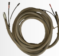
IBIX Pro 3 Extension Hose 0.8" x 30'

with Quick Connect female part with Quick Connect male part